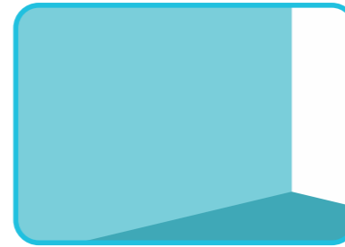
Smooth Matte Finish