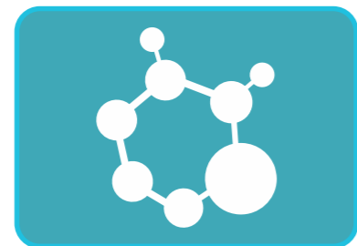
Active Bonding Agents