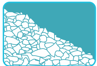
Made from Superior Quality Limestone